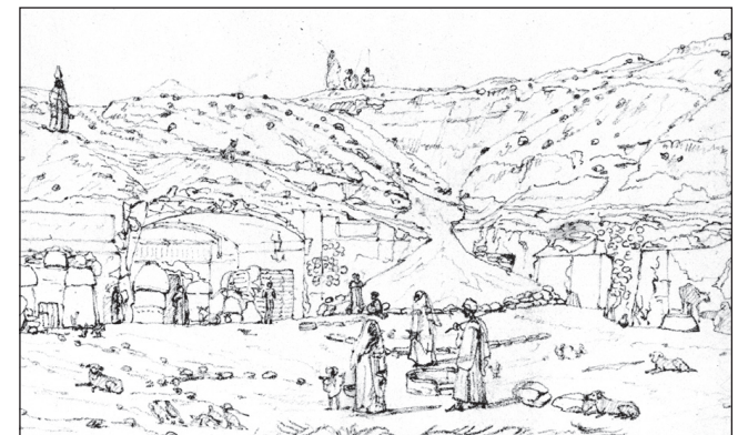
Drawing of tomb-house (bab el-hagar) R. Hay, 1826

To keep administrative costs down, E-mail communication is preferred, but post is available.