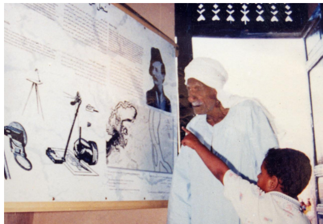
Qurna Discovery in its previous home – now demolished

This display is about the once all-prevalent waterwheels (saqiya) of the Theban plain. It features 19th and early 20th century photos of local saqiya and their owners and workers, and is centred around the actual wheel of the local Bogdadi family which was rescued from rotting on the plain.