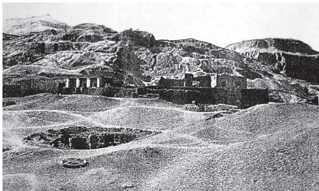
zawia (left) in 1910

This project will ensure that this unique community's cultural heritage is preserved and celebrated for future generations.